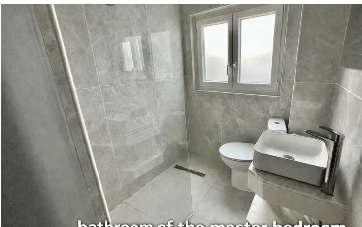
bathroom of the master bedroom